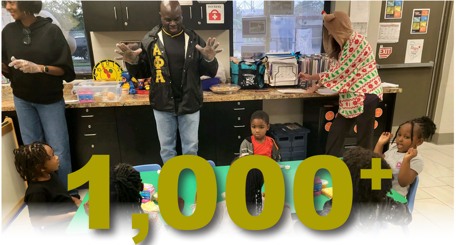
Books And Large Quantities Of Supplies Donated To Orange County Head Start Centers